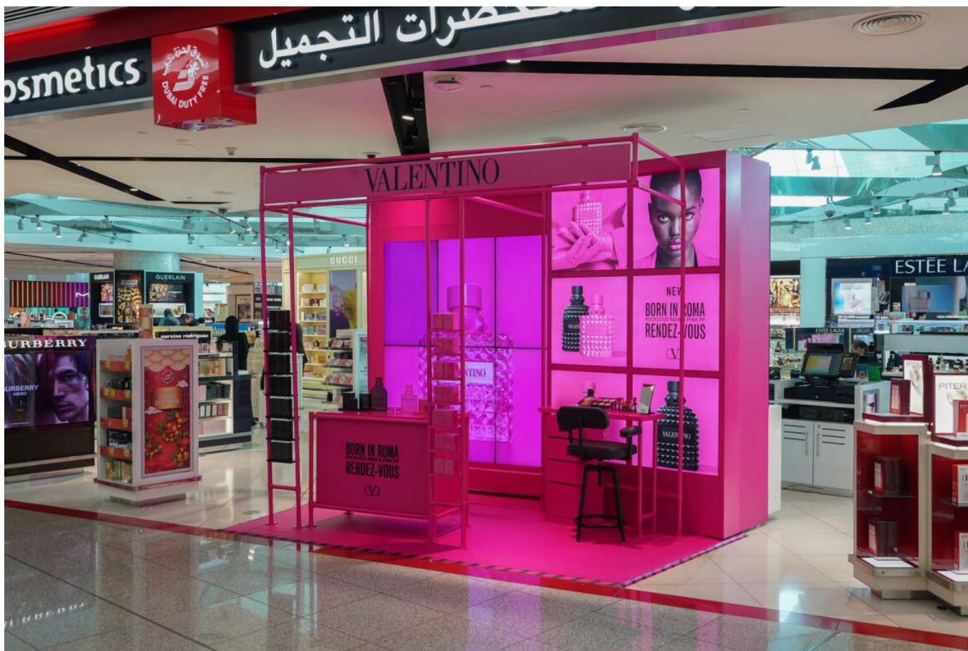
Making a statement: Born in Roma Rendez-Vous 2023 at Dubai Duty Free