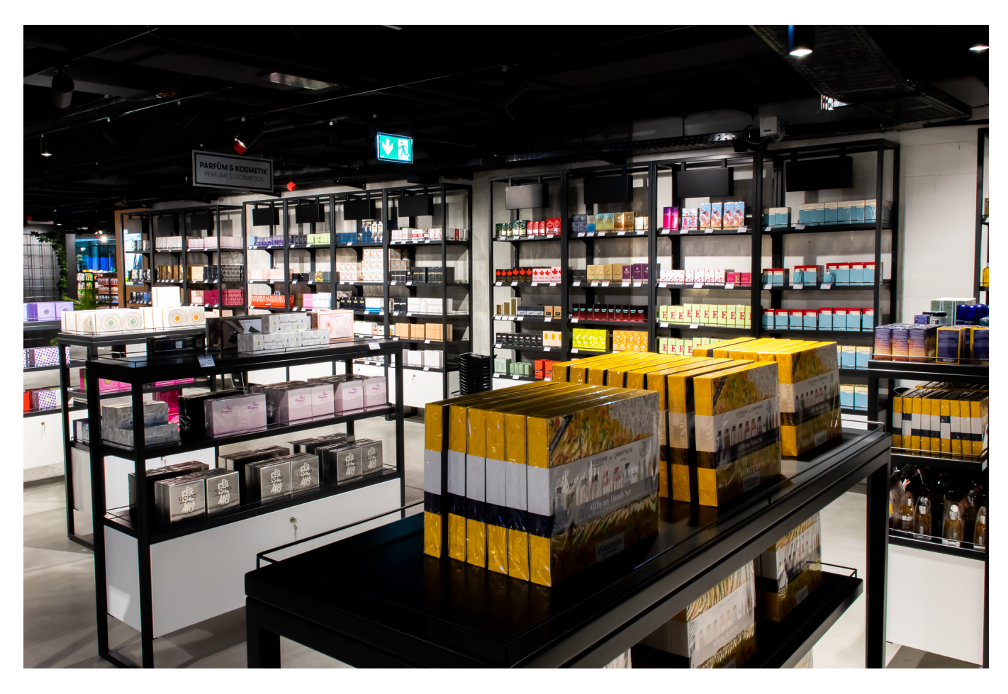
Top P&C brands offer the perfect opportunity to buy as a gift for others or for the travelers themselves

Dufry has just opened its new duty paid shop ANECDOTE at Zurich Airport.