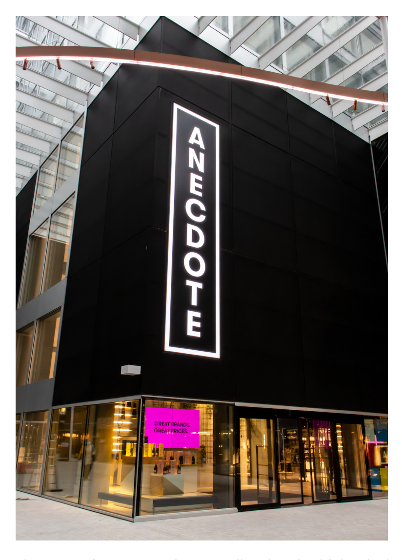
The entry of ANECDOTE is not easily missed, with its sleek, modern industrial feel