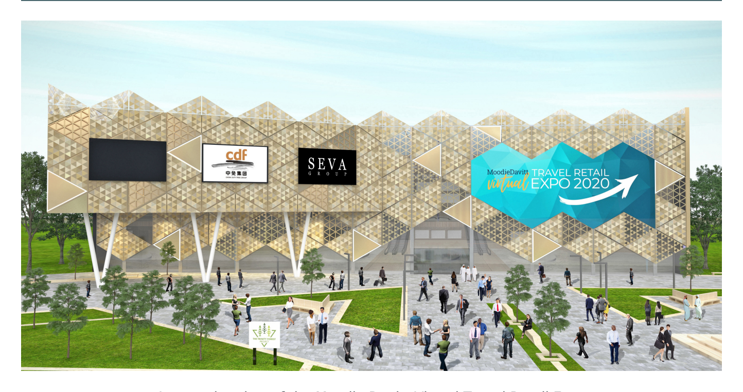
An exterior view of the Moodie Davitt Virtual Travel Retail Expo