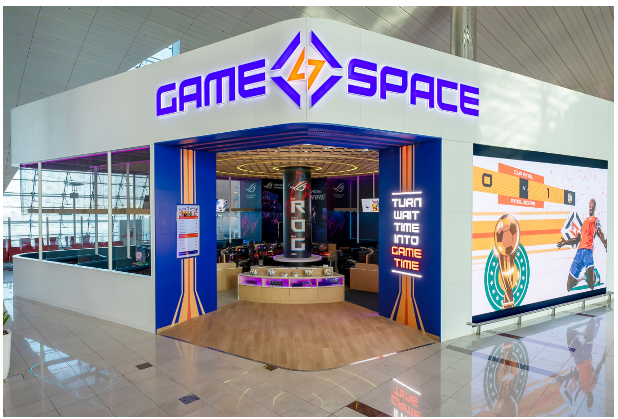
Offering a novel alternative to the normal pre-flight routine of travelers, Game Space is located in the heart of DXB Family Zone at B Gates in Terminal 3