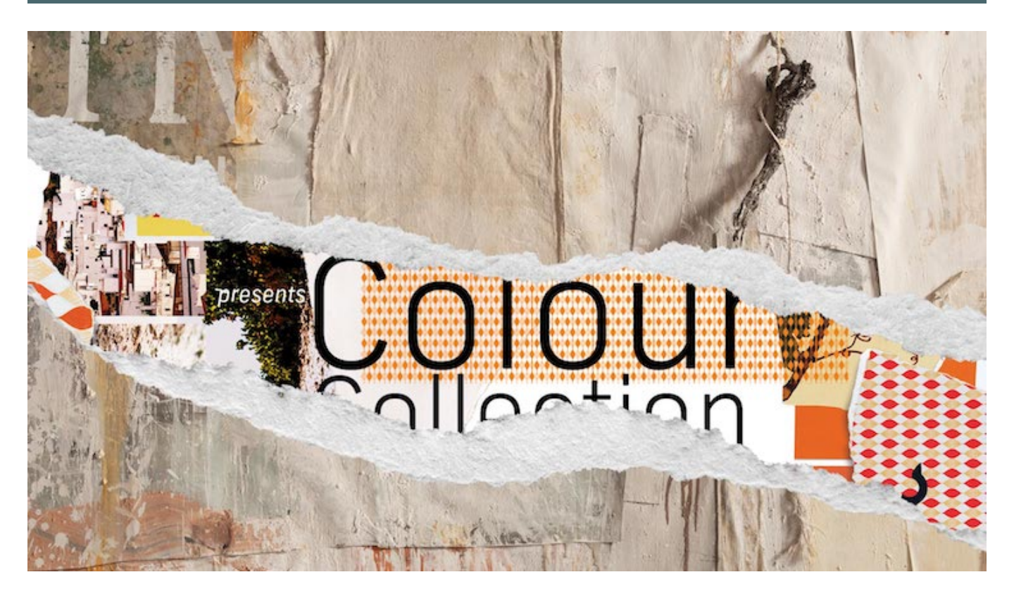
The Macallan Colour Collection teaser

<u>The Macallan</u> has provided a first glimpse of its Colour Collection, a new range of exceptional whiskies exploring the brand's commitment to delivering natural colour through maturation in sherry seasoned casks.