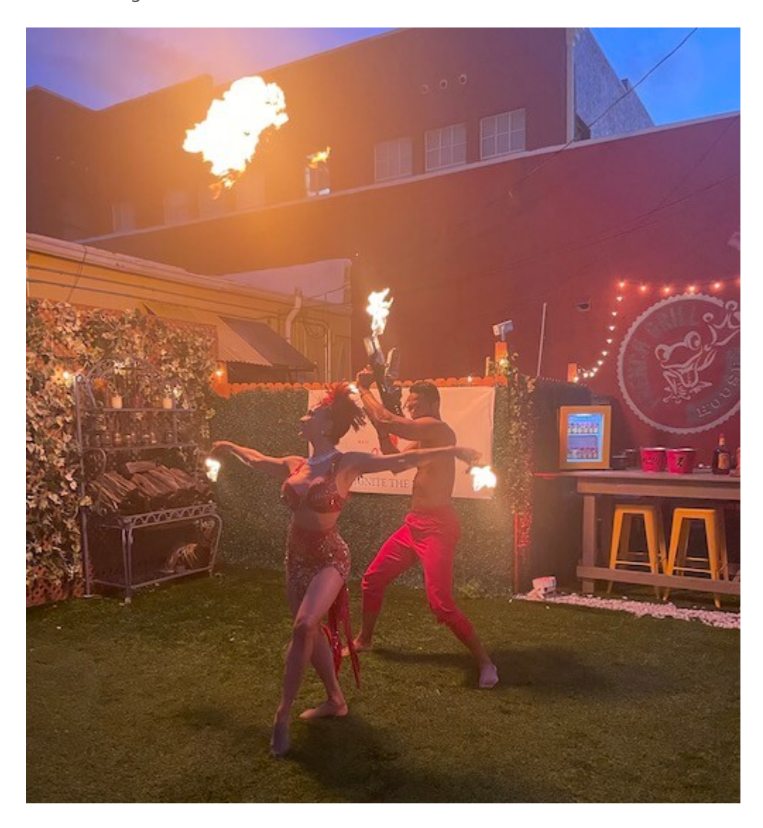
The Ignite the Nite event featured a fire show with two dancers