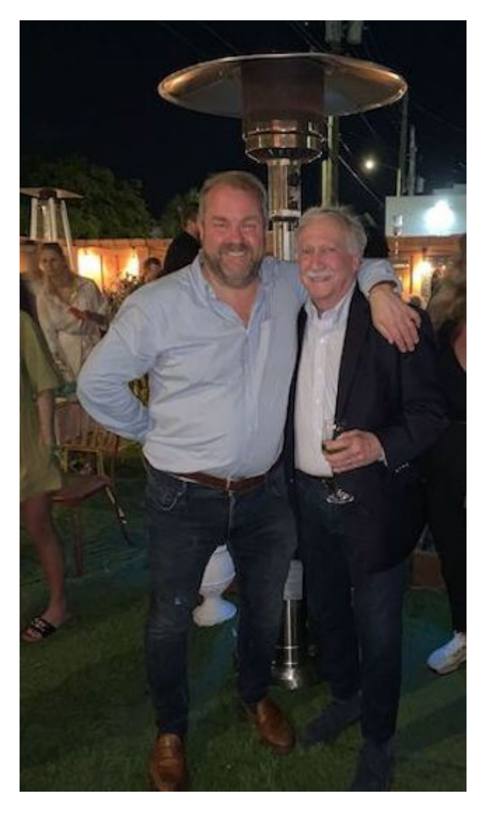
Attendees were invited to network and celebrate all things spirits and travel retail