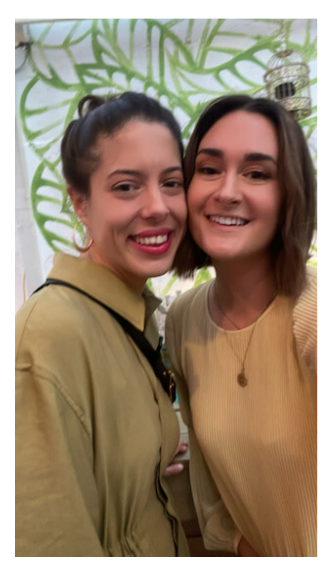
The \ensuremath{\textit{GTRM}} team was in attendance at the Fireball event