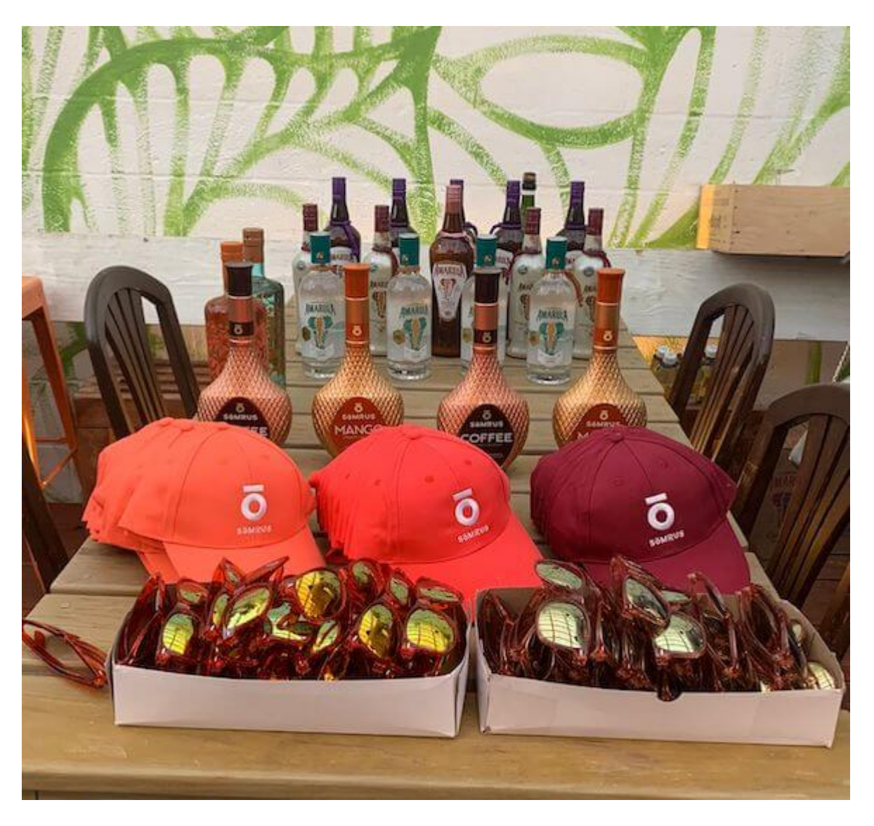
Event swag at the 2023 edition of the Ignite the Nite event