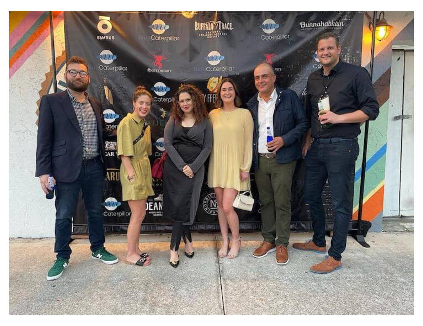
Event attendees and the Global Travel Retail Magazine (GTRM) team