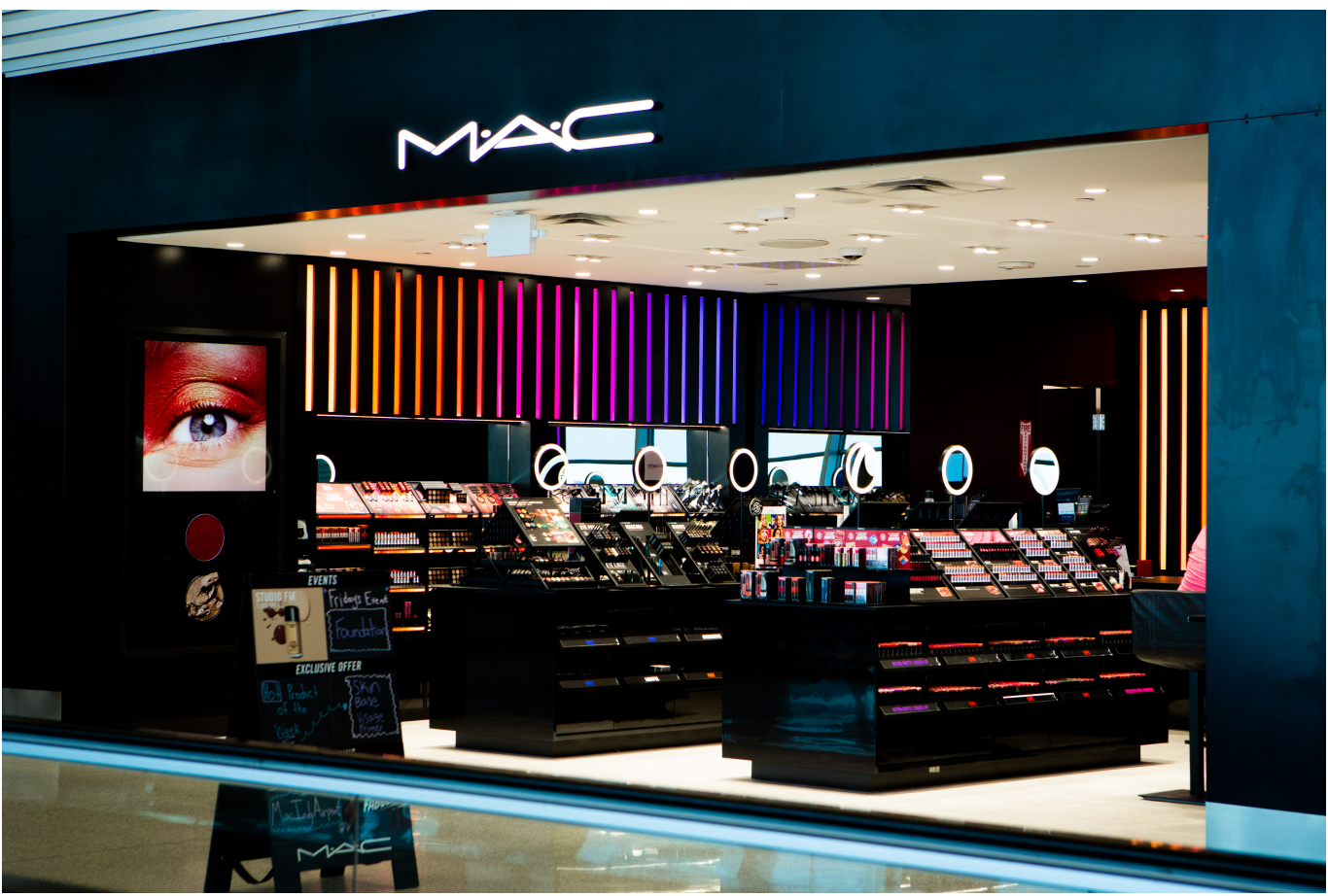
MAC Cosmetics is open for business at the Indianapolis International Airport (IND) as part of the the airports Concessions Refresh program. The program plans to showcase shopping and dining options that include local brands that reflect what it's like to experience Indianapolis